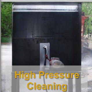
High Pressure Cleaning

Floating Self Centering Head for Pattern Correction